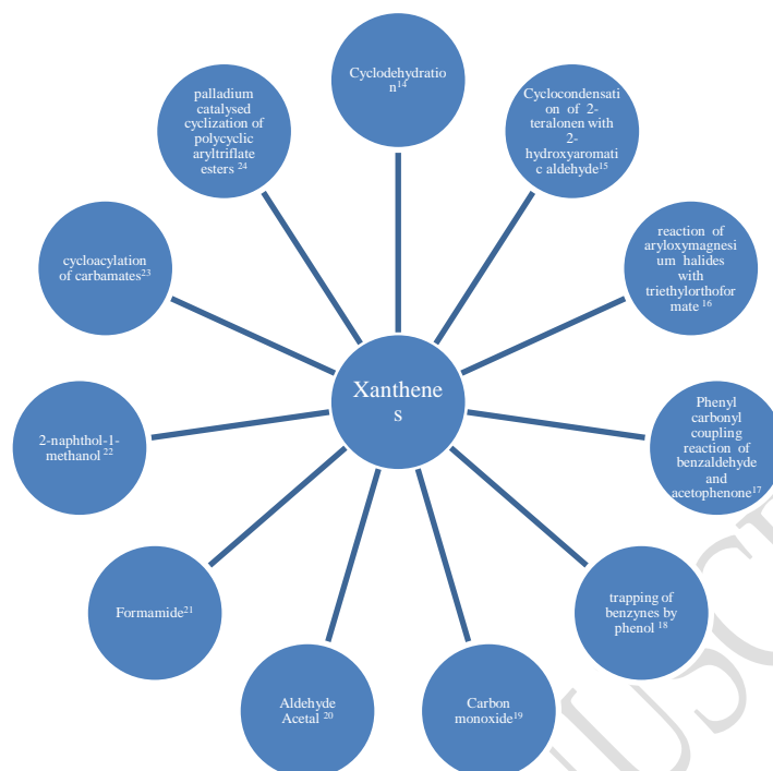
Fig. 1. Various methods for the synthesis of xanthenes derivatives.

However, most of these methods have the following limitations: use of expensive reagents, low yields or a mixture of products, long reaction time, strongly acidic conditions, use of excess reagents and catalysts, use of a toxic organic solvent, and drastic reaction conditions. Therefore, for the preparation of xanthenes derivatives under neutral mild and practical conditions, it is essential to search a new and efficient catalyst with high catalytic activity, short reaction time, recyclability, and simple reaction conditions. The current reaction procedure can be enhanced by facilitating the reaction between 2-naphthol and alkyl/aryl aldehydes by employing various catalysts such as Bronsted acids [25, 26,27], solid-supported reagent [28, 29], metal salt [30, 31], metal triflate [32], I 2 [33], phosphosulfonic acid [34], 1,3,5 trichloro-2,4,6-triazinetriion [35], vanadate sulfuric acid [36], HBF 4 -SiO 2 [37], and Selectfluor™ [38]. However, the improvised method may also have the same limitations such as an expensive and toxic catalyst, acidic condition, long reaction time, low yield, the preparation of catalyst required in some cases, and the use of heavy and toxic metals. Hence, it is imperative to find a new and efficient catalyst with high catalytic activity, short reaction time, inexpensive and easy availability, and simple and feasible procedure for the preparation of xanthenes derivatives.