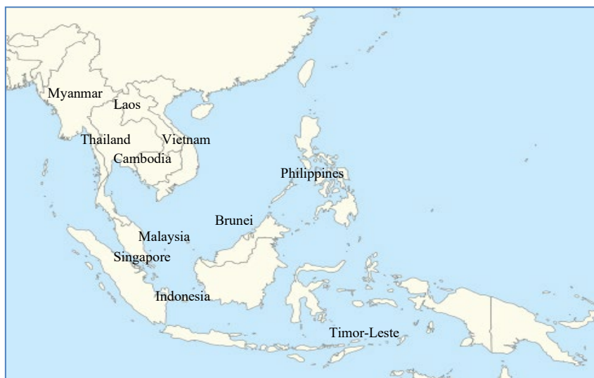
Fig. 1. Maps of South East Asia (SEA) countries.

Thus, this review aims to provide comprehensive information on the occurrence and distribution of 17 selected human pharmaceutical compounds in different aquatic environments, focusing in surface water and domestic wastewater (influent and effluent) in Southeast Asia and with particular reference to Malaysia. There are no reports available in the literature on the occurrence of the targeted compounds in drinking water matrices in Malaysia and other Asian countries. The analytical methods and procedures used for sample preparation (extraction), detection and quantification of these pharmaceuticals are also presented. To the best of the authors' knowledge, this is the first comprehensive review of the occurrence and distribution of pharmaceuticals in Southeast Asia. The data compiled in this study will serve as reference and baseline for future research aimed towards the prevention and mitigation of environmental water safety and security around the world.